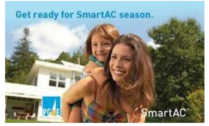
Marketing materials for PG&E's SmartAC program

To prevent this, PG&E has introduced an energy conservation program called "SmartAC." If a customer enrolls, PG&E will install a switch at their residence that allows the company to remotely control their air conditioner - and in times of peak demand, that means turning it down or off. The program is voluntary, and there's no cost to the customer for joining.